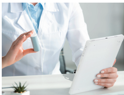
Electronic health record