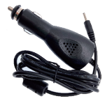
5V3A Car Charge