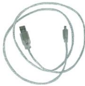
Figure 4: EXTMUSB3FT