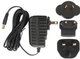
Figure 5: PWR-ACDC-5V2A