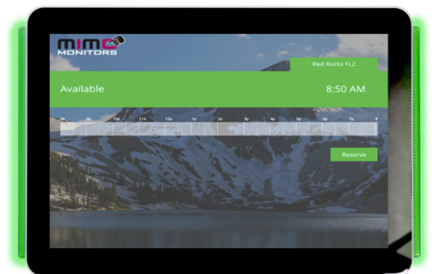
Green LED shown

The tablet uses a quad core Cortex A17 chipset with a 1.8GHz peak frequency that supports the latest ARM processor optimized package. Apps launch instantly and run smoothly. The processor features a quad-core GPU, so that all graphic-intensive apps are fluid and lifelike. All this, combined with 2GB of dual-channel DDR3 memory, distinguishes our tablet