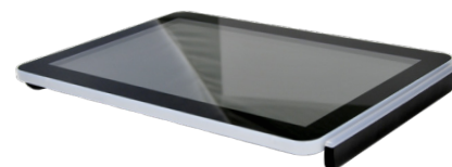
Unlit LED Panel shown

The Adapt-IQV 10.1" is designed with high-quality ABS case with modern zero-bezel design, thus greatly improving scratch resistance.