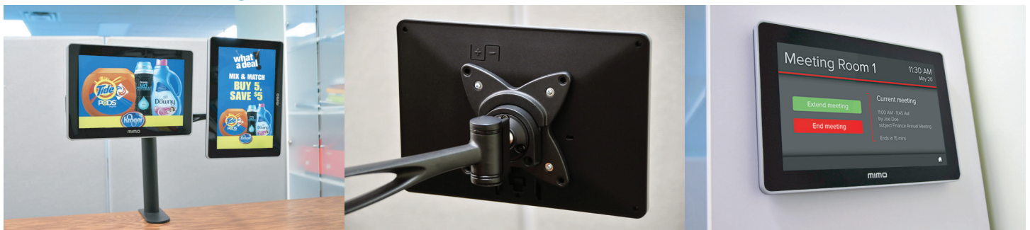
Shown with optional monitor mounts

Mimo Monitors 743 Alexander Rd. Suite 15 Princeton, NJ 08540